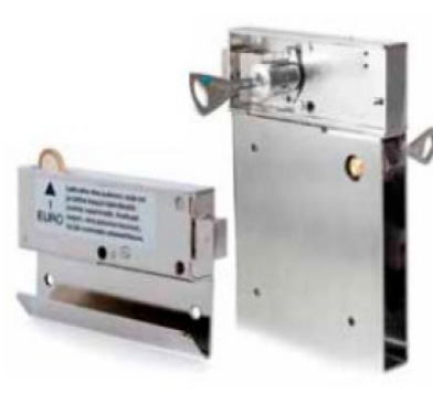
ABLOY coin operated lock