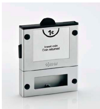
Coin operated lock

Abloy coin operated locks are available with a tray for returning the coin or with a coin box for collection. The locks are operated using ABLOY SENTRY keys and work with €1 coins.